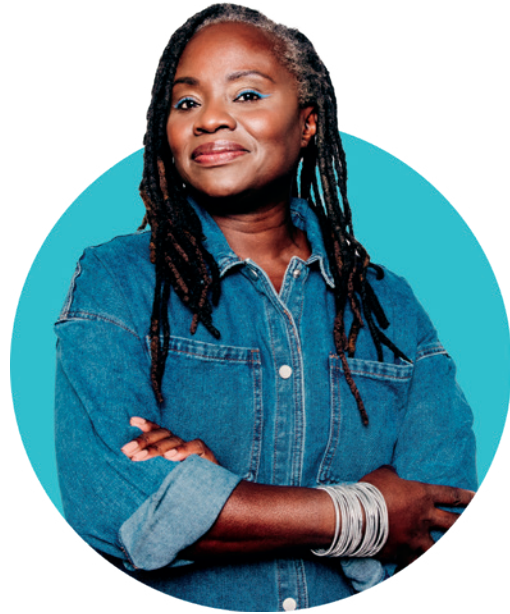
Hypothetical patient case and portrayal.

Rebecca is presenting with acute, severe symptomatic anemia and a history of thrombosis.