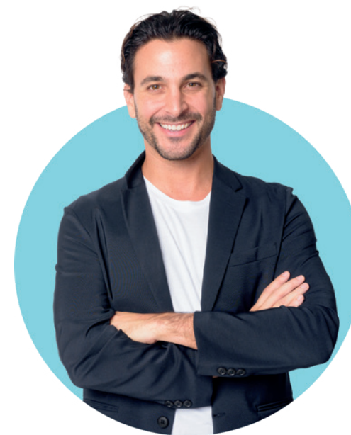
Hypothetical patient case and portrayal.

Tim is presenting with chronic anemia over the last 2 years.